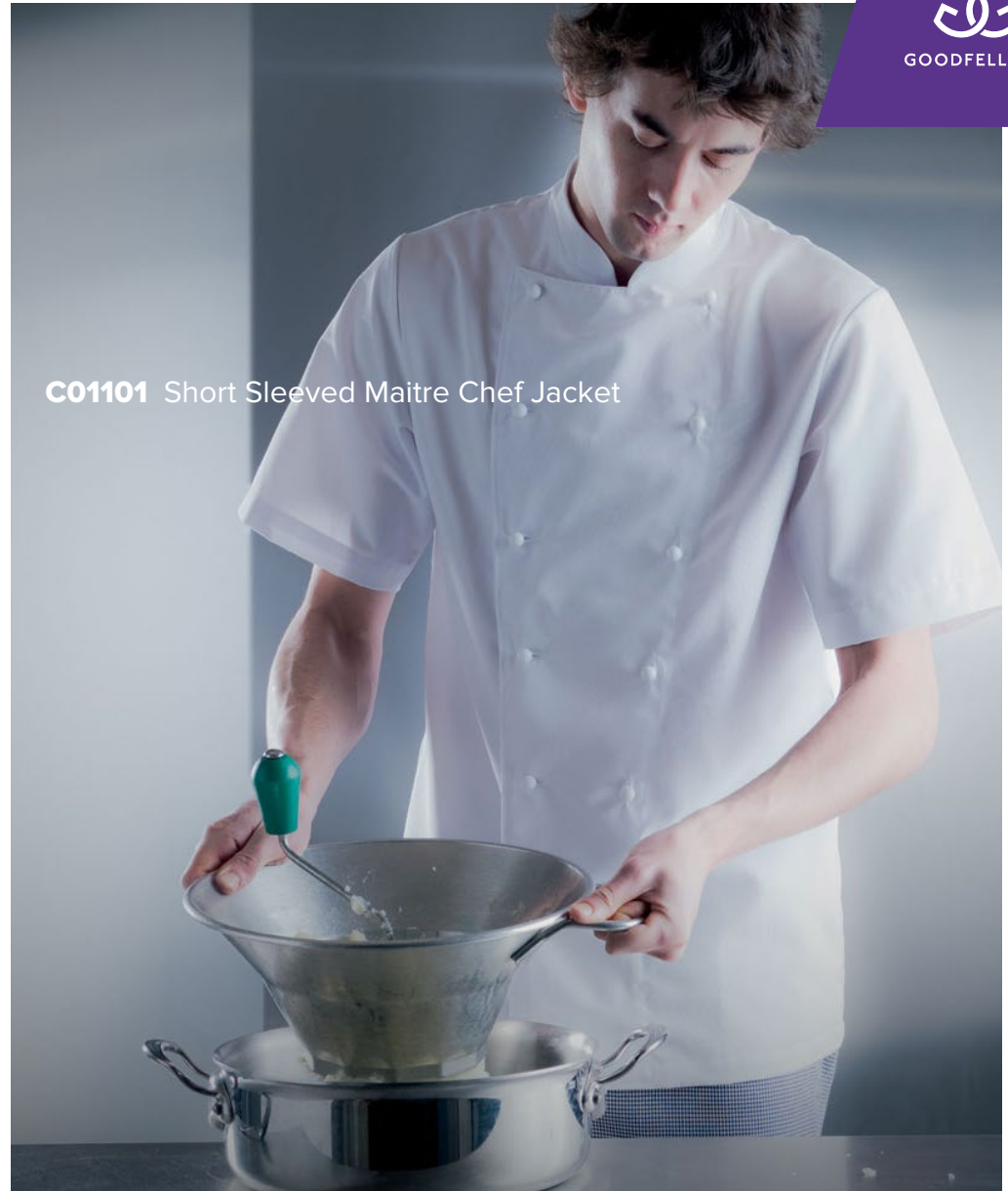
C01101 Short Sleeved Maitre Chef Jacket

*Price includes delivery. Geographical restrictions may apply. Please call for details.